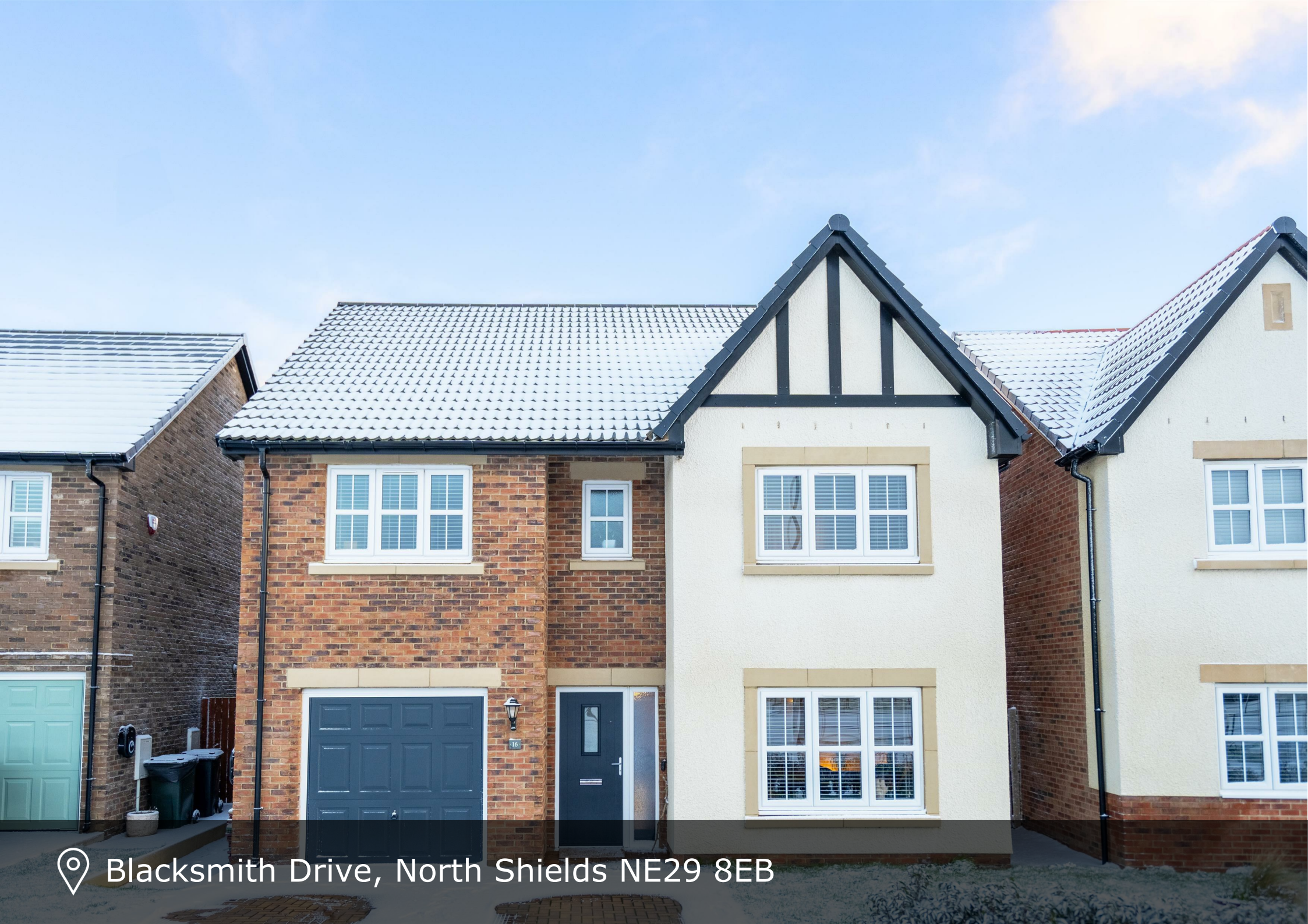
📍 Blacksmith Drive, North Shields NE29 8EB